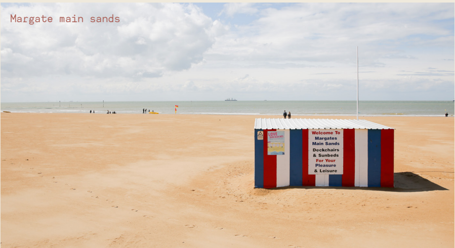
Margate main sands

Botany Bay - 35 minute walk from the hotel, surrounded by white chalk cliffs. Great for families.